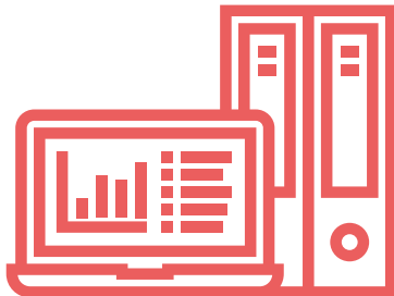
Macroeconomic trends and policy