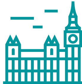
Institutions and governance