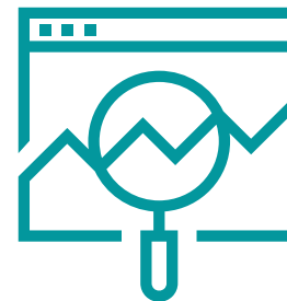
Measurement and methods