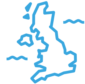
Geography and place