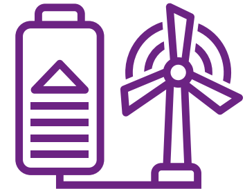
Social, environmental and technological transitions